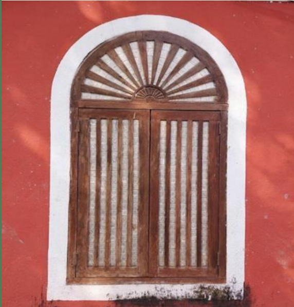
SETHU CENTRE Saligao, Goa

I begin this Journey to connect with the Goan Diaspora across the globe, straight from the heart of a Goan residing in Goa.