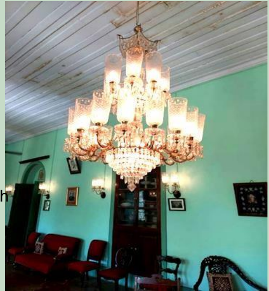
Gaunekar House, Bandora (Ponda Taluka), Goa

It is only after the advent of affordable electricity that the wax candle sticks were replaced by electric bulbs.