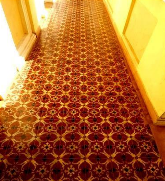
ACHIE'S GRANDEZA Celio Mascarenhas Chandor, Goa

Originally the flooring of Goan houses was carpeted with cow dung as it had good binding properties and acted as a disinfectant. It was also a material that was easily available, as almost every household had a stable full of cows.